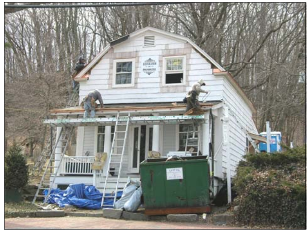
The Bedford Store under renovation