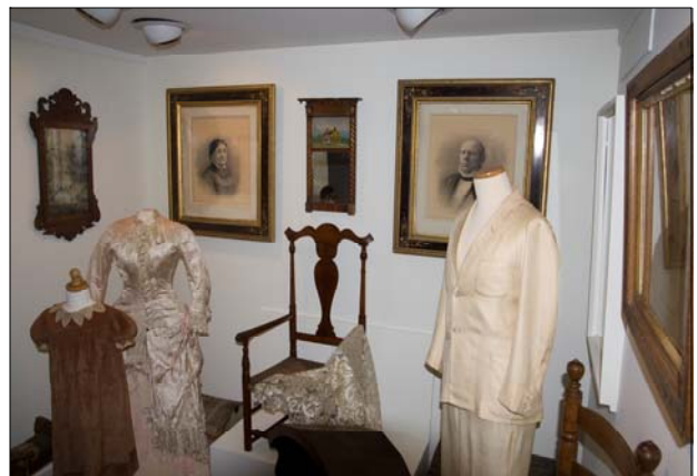
Refreshed exhibits at the Museum