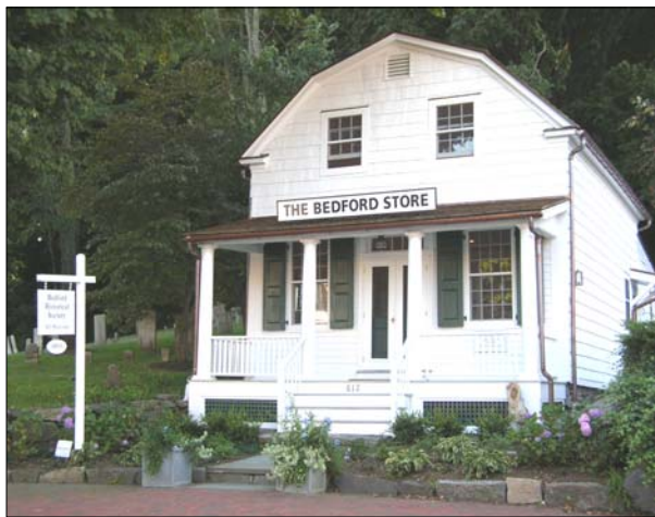
The Bedford Store - new home of the Bedford Historical Society Resource for the Bedford community