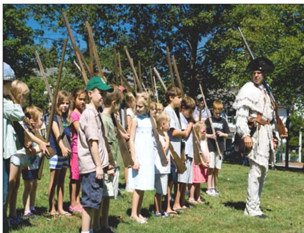
Reenactors drill participants on the Village Green At the Bedford Village Treasure Hunt